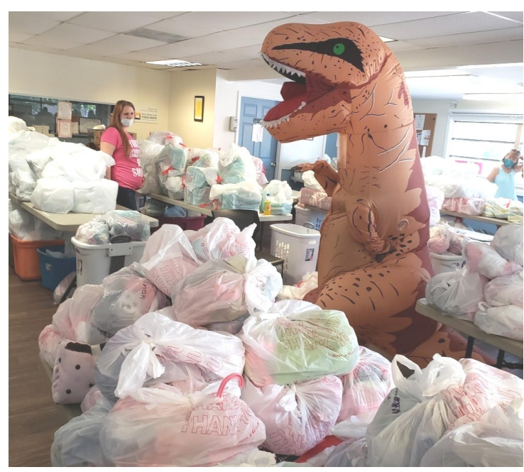
Preparations for an outside "Give Away"

CCAP plans to open its doors to its clients and expand program hours as soon as is safe in 2021. We are committed to continue serving the Winchester/Frederick County Virginia area with the four program areas CCAP is known for: Food Pantry, Clothing House, Financial Assistance and Homeless Services. CCAP hopes to continue to partner with other area agencies to provide more comprehensive and cohesive services and to exact a better result for the client. CCAP began this process last year by coordinating Christmas with Highlands Food Pantry, United Way, Salvation Army, Rescue Mission and Bright Futures. CCAP is in