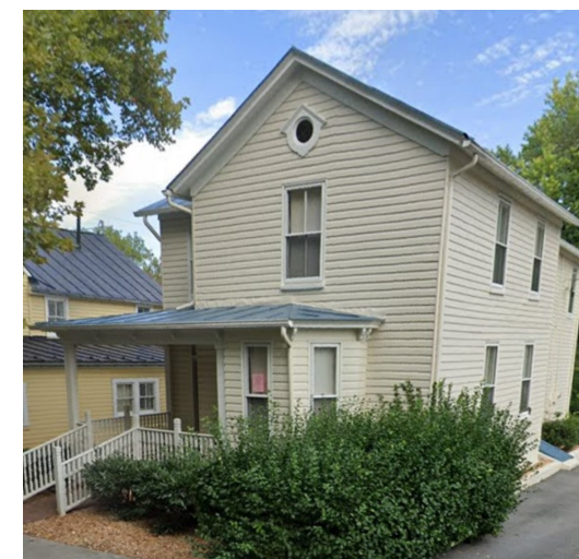
Our clothing house at 106 S. Kent Street

CCAP formed in October of 1974 by eleven local churches as the Christian Cooperative Action Program, changing its name to Congregational Community Action Project in 1975. We are a 501(c)(3) non-profit, charitable organization that is funded by area faith communities, businesses, civic groups, bequests, and private individuals. As an all-volunteer organization (with the exception of our Executive Director full-time position), we are able to designate a vast majority of monetary donations directly to client expenses.