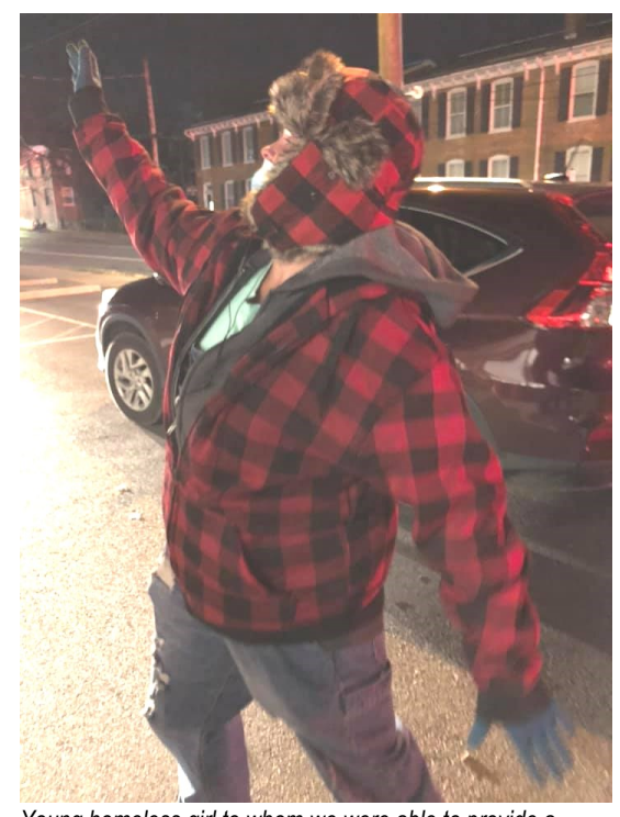
Young homeless girl to whom we were able to provide a winter coat, matching hat and boots - Dec. 2020

20-30 families have been served on a weekly basis