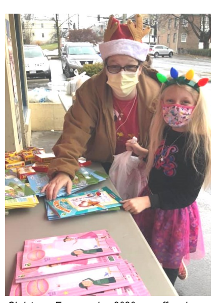
Christmas Eve morning 2020, we offered stocking stuffers, coats, hats, gloves, blankets and a bag of food for clients. Just when we needed larger teen boys hats and gloves, a family pulled up and donated 2 large bags. We were able to serve 60 families. What a blessing to be a blessing to others!

SPECIAL GIVE AWAY EVENTS: CCAP gives away surplus food and other items that have been donated, as well as needed supplies for those who have no fixed address. See our Facebook page for dates and times for these special events.