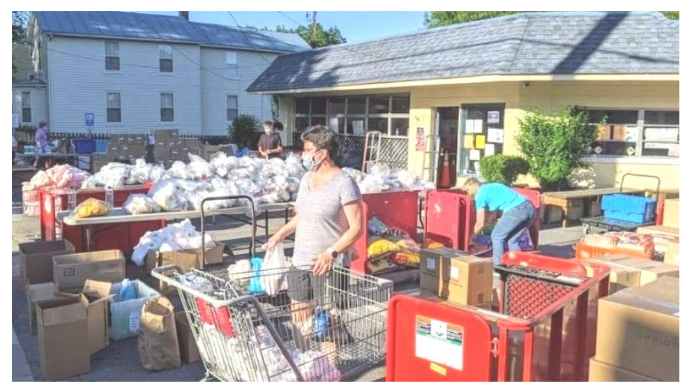
Another of our outside "Give Aways", prepared and executed by our AMAZING volunteers.

CCAP is extremely grateful for our generous donors. We have been able to provide more funding for financial assistance even in the wake of a pandemic because of the generosity of our community. A very big and heartfelt thanks!